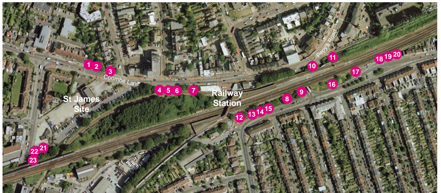
Plan of existing advertising hoardings within the Local Centre Enhancement Area

All hoardings are shown on the adjacent map with details of notices served in the accompanying table.